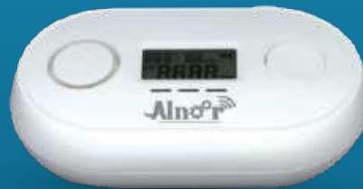
CARBON MONOXIDE DETECTOR