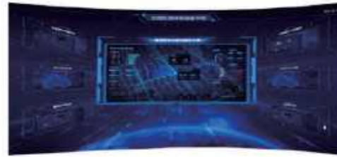
City Level Parking Platform