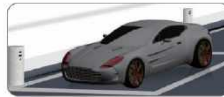
Low-Position Camera Pillars: 1-to-1 Recognition

High-Position Parallel Recognition / High-Position Vertical Recognition