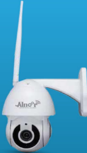
WI-FI SPEED DOME CAMERA