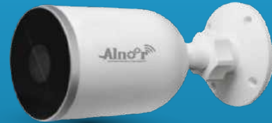
WI-FI BULLET CAMERA