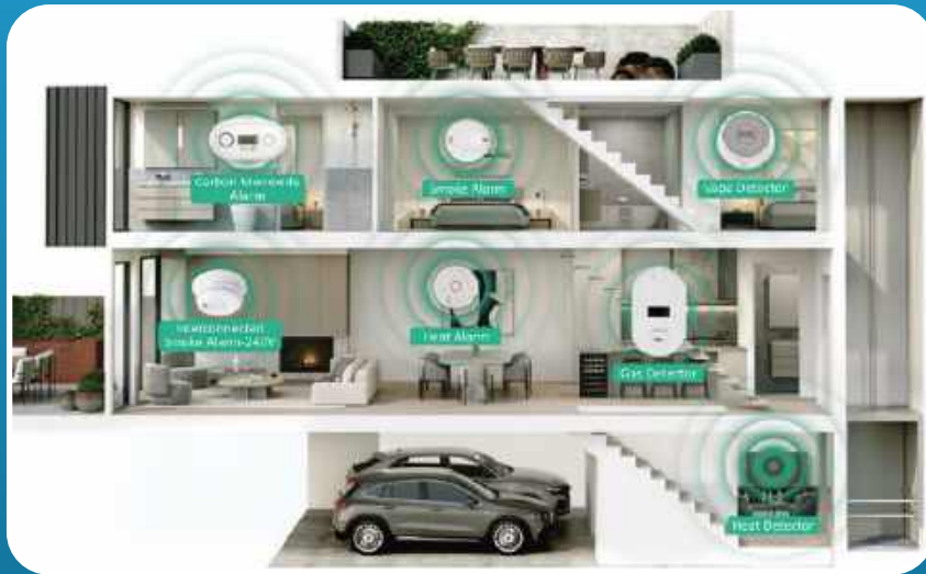
Interconnected Product Illustration