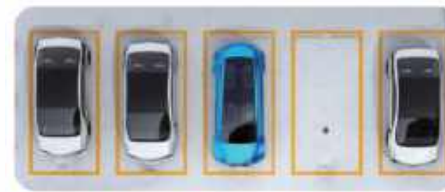
Magnetic Sensor: 1-to-1 detection.

Installed facing the rear of parked cars, one for one parking space.