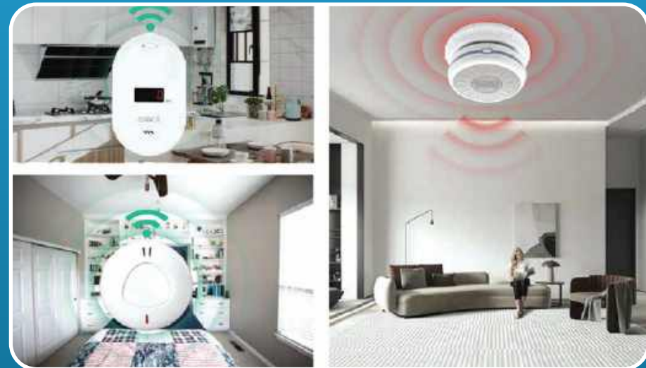
A Hidden Danger Collective Alarm

When you are in the living room and the smoke detectors in other rooms sound alarms, the detectors in the living room will also sound alarms to remind you.