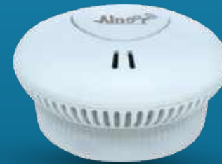
ACTIVE - WI-FI SMOKE DETECTOR