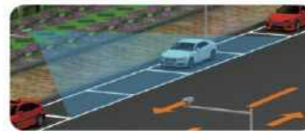
High-Position Cameras: support up to 8 parking spaces detection

High-Position Parallel Recognition / High-Position Vertical Recognition